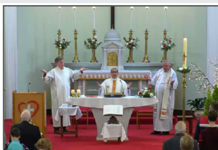
A special celebration of the Eucharist at the Sacred Heart Church in Cork.