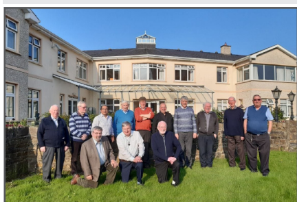
Our Superior General meets MSC members on the Western Road, Cork.